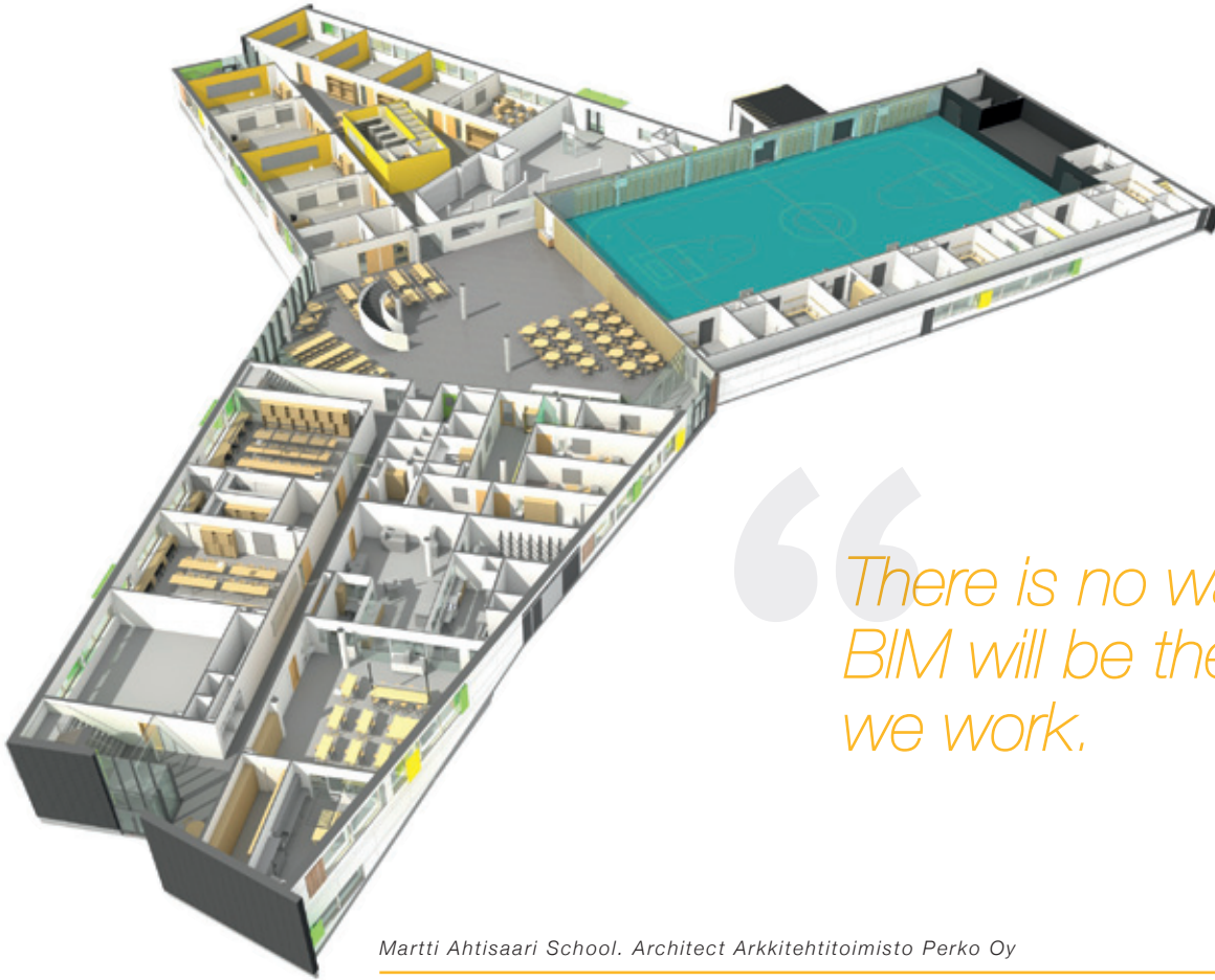
Martti Ahtisaari School. Architect Arkkitehtitoimisto Perko Oy

“There is no way back. BIM will be the way we work.”